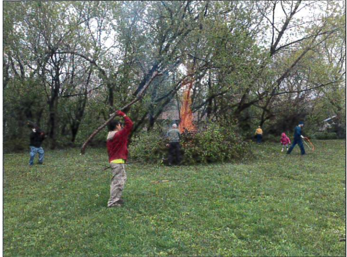
Engulfed by a wall of invasive buckthorn, the Tully Park residents and the NRC worked hard to remove public enemy # 1. After several workdays, a clear path to possibility emerged.