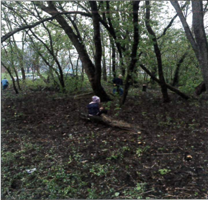
This is the southwest corner of the park immediately after clearing the invasive buckthorn in the fall of 2016. Notice the Monarch on the blazing star below. Pollinators have made a big comeback at the park.