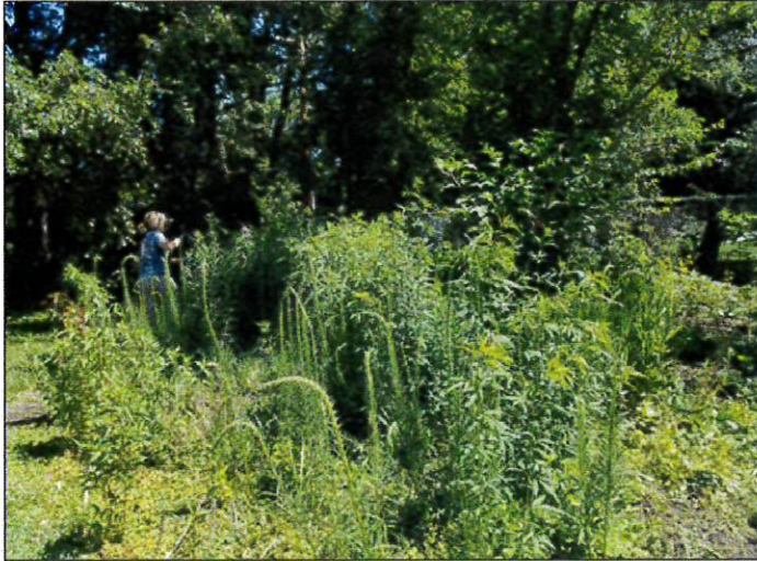
This is the area in the northeast corner of the park that is slated to become the meditation area. A winding path, bench and mature native plantings will add to the calm and seclusion the area will need.