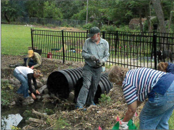
The creek banks were stabilized by volunteers with several deep rooted native species of sedges, rushes, grasses and forbes.