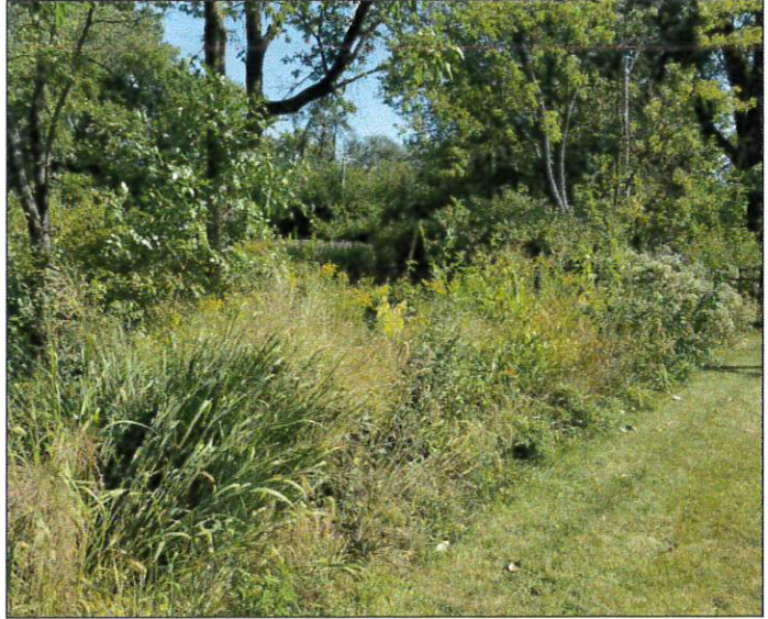
The restored area also offers cover for the amphibians whose populations have increased with the removal of the buckthorn and the creation of favorable habitat.