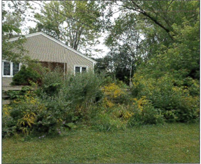
The same area in 2021 with an abundance of native species. Seen here are Sky Blue Asters, goldenrod, sneeze weed, blue lobelia and cardinal flower.