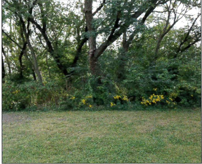
In 2021, the heavily seeded areas started to pay dividends with tall bellflower, Rudbeckia hurta and other native species. The collective habitat attracts and supports birds, insects and wildlife in addition to becoming a vital link in the migration paths.