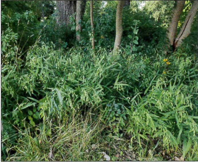
The southwest area above, shows an abundance of River Oats in year 4. The photo below shows year 5 of the creek bank stabilization. Deep rooted grasses and sedges have more biomass underground than above ground which stabilizes the creek bank.