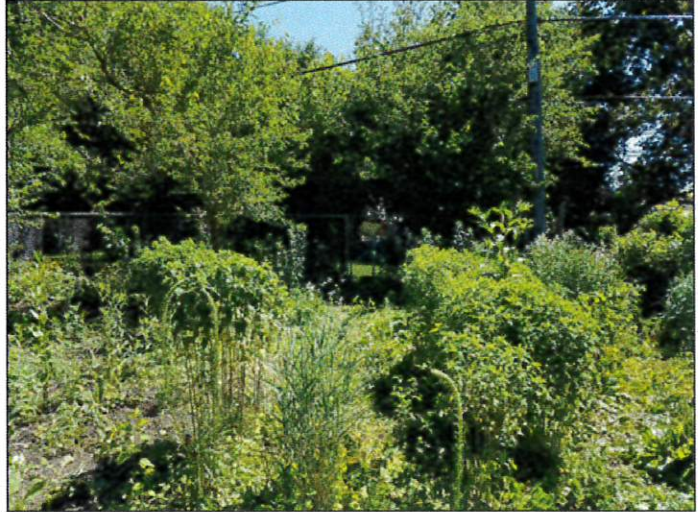
This area was frequently underwater for a good part of the time but is now relatively dry because of the native plantings. Walking paths and more diversity will further develop the area.