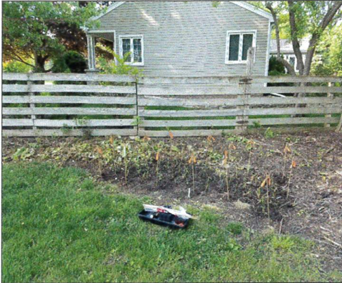
This is the area immediately to the north of the park. This is just after clearing the area and preparing it for native plantings and seed. Fall 2016