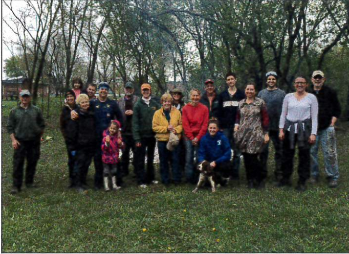
Fall of 2016. Tully park and PHNRC volunteers