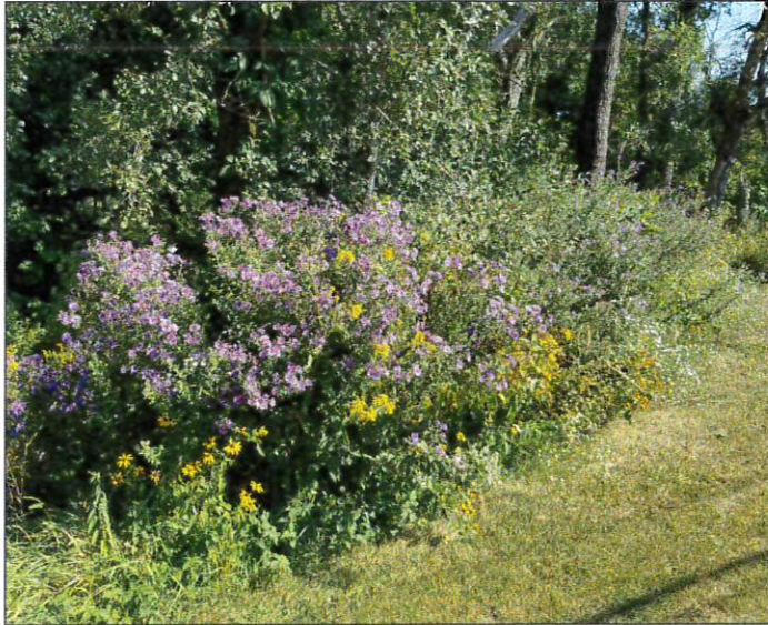
A mix of asters, black-eyed Susan, Goldenrod, milkweed and Liatris add visual interest, creek bank stabilization and a vital food source for migratory birds passing through.